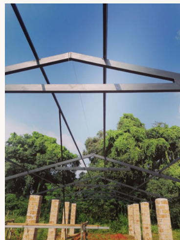
CATTLE SHED CONSTRUCTION UNDERWAY IN MAVITTAPURAM