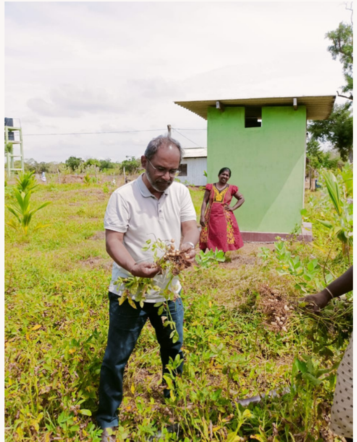
INSPECTING THE THRIVING PEANUT PLANTATION FOR QUALITY AND GROWTH

In Thatchanamaruthamadu (Palampitty District), we manage a 15-acre farm. Currently, we have cultivated 600 coconut trees, as well as peanuts, urid dhal, sesame, and seasonal vegetables for sale in local markets. Recent substantial rainfall has alleviated our water-related challenges. We anticipate that the farm will generate sufficient funds to sustain itself next year. We have recently ventured into poultry farming, approaching it with a deliberate pace to comprehend the intricacies of maintaining a thriving poultry farm. Currently, we are managing a flock of 500 chickens and are enthusiastic about expanding and enhancing this business in the future. Additionally, our goal is to contribute to the welfare of the local village by creating job opportunities. Starting in January, we plan to initiate weekend tutoring sessions to provide extra educational support to school-going children.