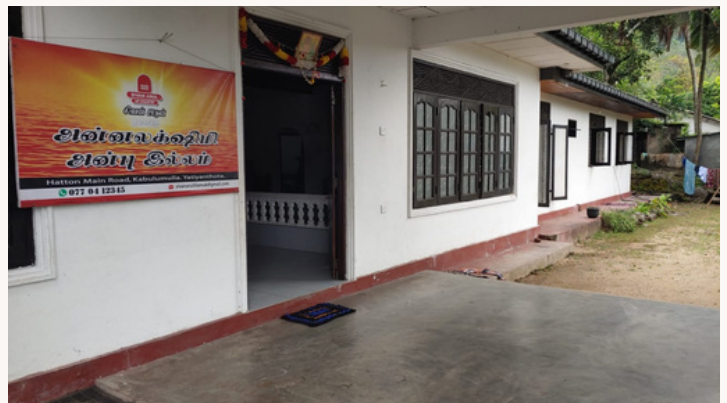
ELDERS HOME AT YETTIANTHOTA-UPCOUNTRY