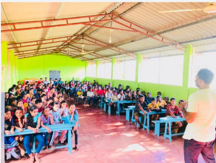
EDUCATION CENTRE AT OLUMADU

By running evening and weekend classes, the foundation ensures that these educational opportunities do not interfere with the regular school hours, thereby complementing the children's primary education. Conducting regular exams and monitoring academic progress are crucial aspects of the program. This not only helps in assessing the effectiveness of the tuition but also in identifying areas where students might need additional support.