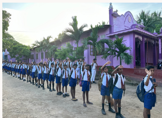
SIVANARUL BOYS EMBARK - A JOYFUL JOURNEY TO SCHOOL IN THE MORNING