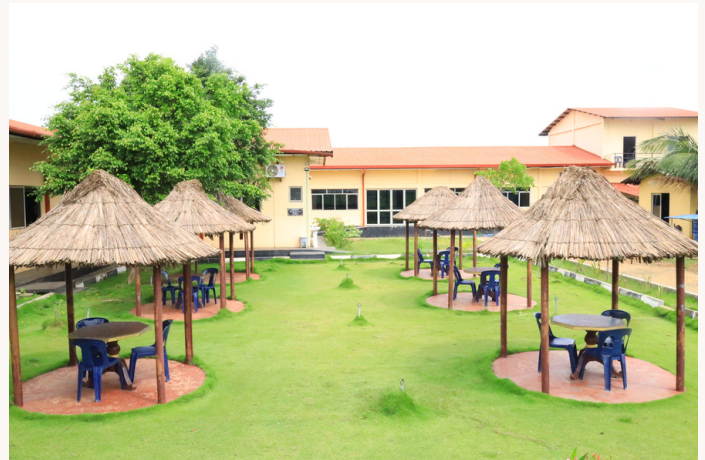
OUTDOOR CABANAS AT RUDRAM

We envisage a significant expansion for our restaurant in the next few years, given the steady influx of tourists from India arriving at Thalaimannar by ship. The restaurant also provides high-quality accommodation options for tourists, featuring a facility with four double bedrooms.