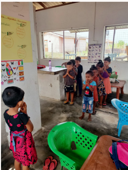
KANCHIRANKUDA PRESCHOOL- PRAYERS