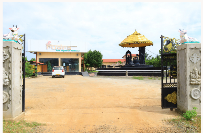
SRI RUDRAM RESTAURANT- OUTSIDE VIEW