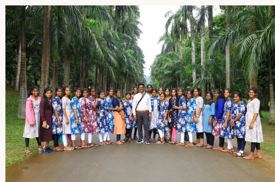
SENIOR STUDENTS AT SIVANARUL-LATEST EXCURSION TO UPCOUNTRY