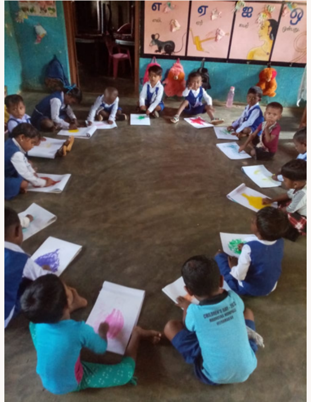
KINDERGARDEN AT NEENARNKERNI

Our approach at Sivan Arul is not merely academic; it's about shaping character and fostering emotional well-being. We strive to create a holistic educational environment that nurtures well-rounded individuals who will contribute positively to society.