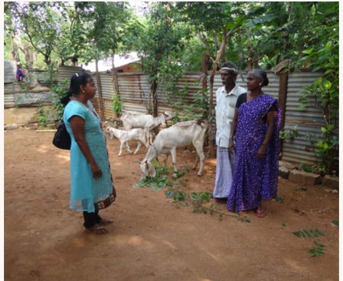
REVOLVING FUND- GOAT REARING

It's heart-warming to see the positive impact of the revolving fund projects initiated by the Sivan Arul Foundation. These projects not only empower single women and vulnerable families but also contribute to the overall development of the communities involved. The focus on small businesses like home vegetable gardening, small-scale farming, home catering, and poultry provides sustainable sources of income for these individuals. Regular support and supervision are given to ensure smooth running of each individual projects.