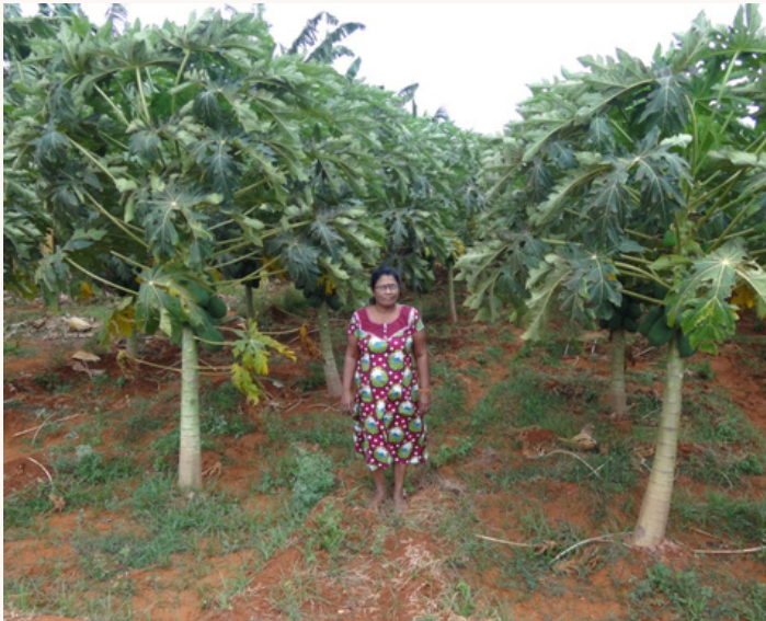
REVOLVING LOAN- PAPAYA PLANTATION