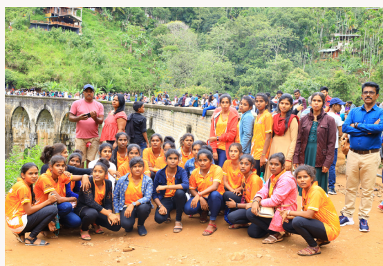
SENIOR STUDENTS AT SIVANARUL-LATEST EXCURSION TO UPCOUNTRY