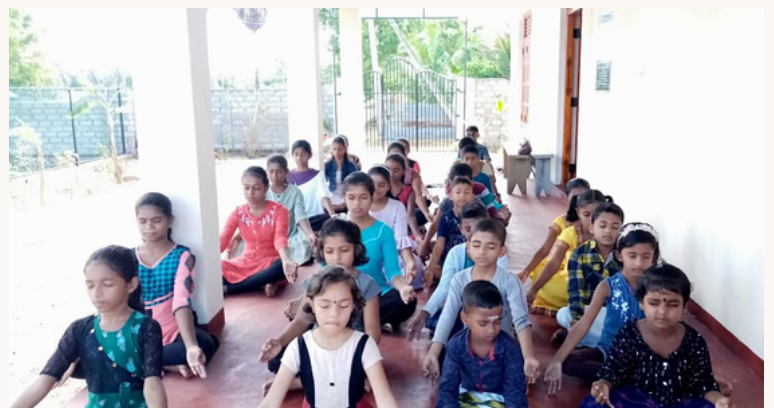
MEDITATION AT THIRUKOYIL ARANERI SCHO