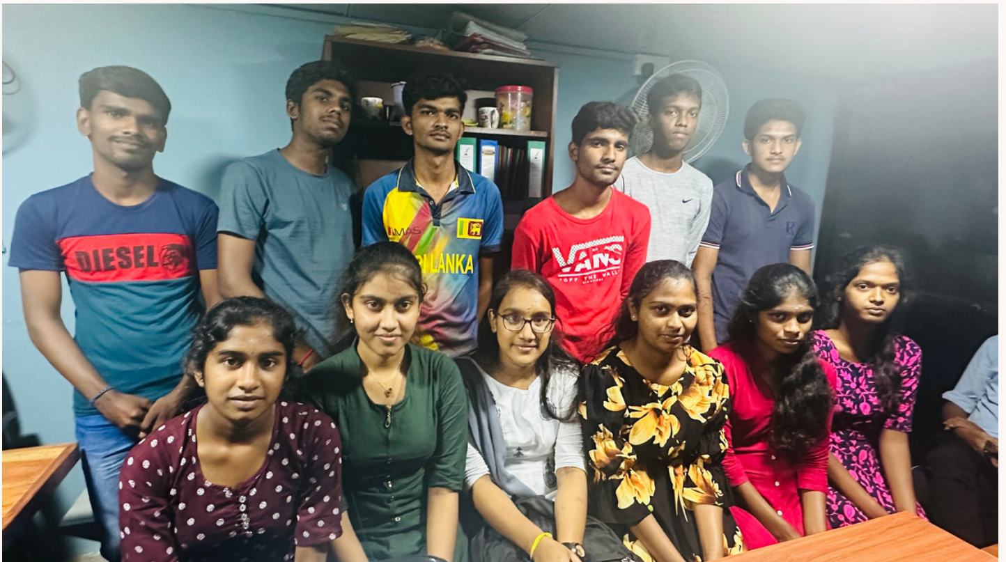
UPCOUNTRY STUDENTS WHO RECEIVED COACHING FOR UNIVERSITY ENTRANCE

We extend our heartfelt gratitude to our generous donors from Australia, whose contributions were vital in making this project a success. The journey wasn't easy. It required these students to adapt to a new environment and commit to rigorous studies. However, their hard work and determination were evident in their outstanding performance in the recent trial exams. This success has bolstered our confidence in the potential for exceptional university admissions for this talented group. Encouraged by this success, we are now gearing up to launch a similar program for 12 girls in comparable circumstances. Many of these students aspire to become doctors, and we at Sivan Arul are dedicated to helping them realize their dreams. This initiative not only showcases our commitment to educational equity but also underlines our belief in nurturing the potential of young minds to contribute positively to our society in the future.