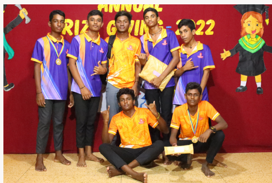
ANNUAL PRIZE GIVING DAY AT CHILDREN HOME- BOYS WITH SPORTS MEDALS

Our home has also excelled in the realms of sports and arts. In the Mannar zonal district sports competition, our children achieved first place, showcasing their talents and team spirit. Additionally, our children demonstrated exceptional skills in art and dance, earning them the top position in the district. This is a testament to the dedication of both the students and our team, working collaboratively to foster a conducive learning environment. With your continued support, we look forward to creating more success stories and making a lasting difference in the lives of those who need it most.