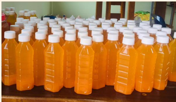
Palmyra juice for export

“Our vegetarian restaurant has been functioning well. Four of our senior students who have graduated from the children’s home have taken over various duties. However, we had a major setback with the COVID-19 crisis as we had to close the restaurant indefinitely causing financial difficulties.