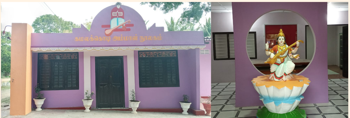
Recently built library at Children's Home

A reference and reading library has been built at the children home to encourage children to read books. Daily newspapers are available for the children to read. Regular time has been allocated for boys and girls to spend time in the library. New books in Tamil and English are added regularly.