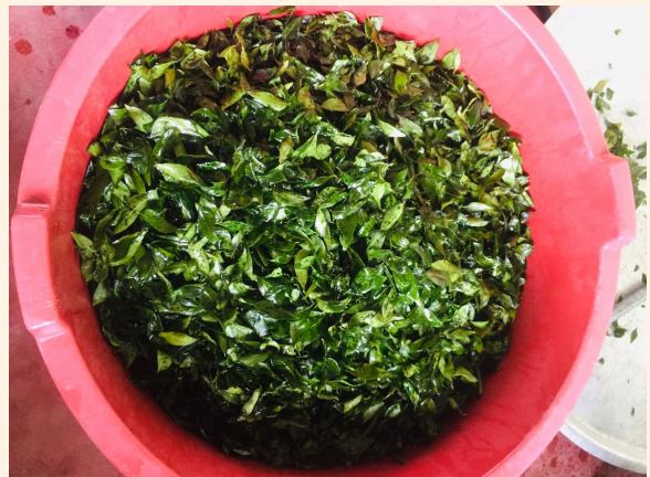
Fried curry leaves for export

We are now using the premises as a major production centre for Palmyra products, pickles and other savoury items. The restaurant has re-opened to the public from December, but we are only selling food parcels, as in-dining has been temporarily stopped until it is safe to resume. We intend to keep this production centre as a separate business enterprise.