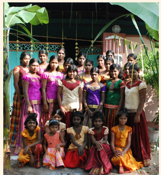
Pongal Festival celebrations at the girls home

As of January 2021, we plan to start a hostel facility near the children's home to provide accommodations for children living under the poverty line so that they may stay at the hostel and attend the local school. A new building to house 25 girls is being constructed near the girls home and boys will be housed at the new houses constructed at Sivapuram. Children from rural Mannar, Eastern District and Upcountry have been selected. This year our intake has been limited to 30 but we envisage this number to increase with time. The Sivan Arul Foundation continues to strive to nurture mature, well-balanced children with good values.