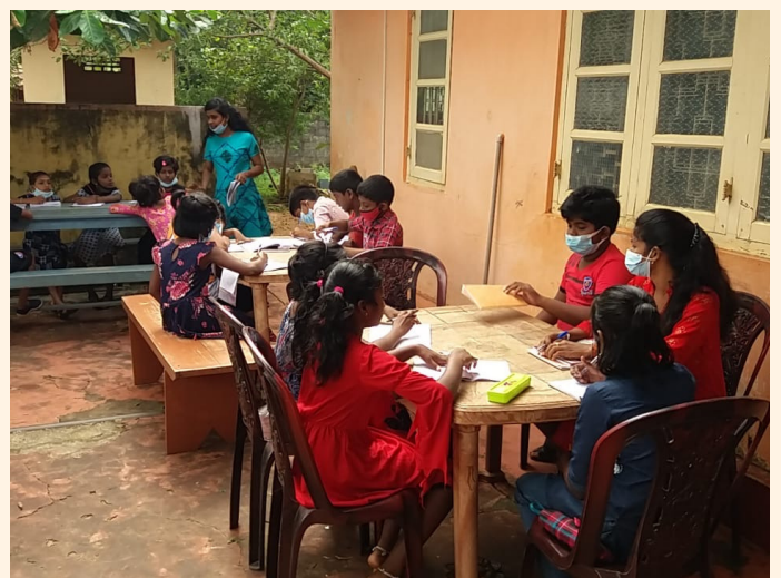
Children attending weekend class in Kondavil

Sivan Arul is the first charity organization to start kindergarten centers (Paalar Paadasaalai) on a large scale and these are all located in the East. Jaffna Central College Old Boys' association from Sydney donated towards a three-year project to start a kindergarten facility in Amparai. Although this was closed for a long period during the COVID-19 crisis, we have reopened last month and hope to successfully run programs for the children next year. Our goal is to have many such centres blossoming in the East, to better prepare and motivate students for formal schooling. In addition, Sivan Arul Foundation provides study materials including school bags, books, pencils and pens to underprivileged children.