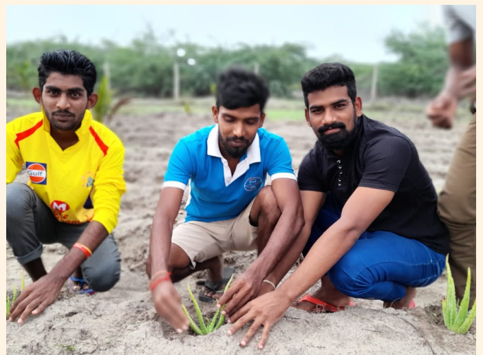
Aloe vera plantation by the senior students

Six houses are being built in this land; each of these houses will be given to orphaned children leaving from the Sivan Arul Foundation Children's Home. Individual donors have generously donated to build these houses. We envisage some of our children building a livelihood by farming on and residing in this development.