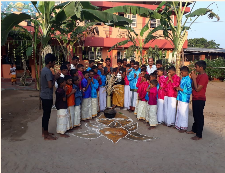
Pongal Festival celebrations at the boys home