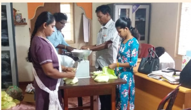
Dry food packs being prepared by volunteers

During the COVID-19 crisis, many labourers and farmers lost their work and had no means of feeding their families. Similarly, during floods, plantations and houses were destroyed. To provide relief, the Sivan Arul Foundation launched a massive dry food distribution to remote villages. Dry food ration packs including rice, lentils, tea, sugar and soya meat as a source of protein were supplied to the affected individuals with the help of divisional secretaries of the villages. We thank all the donors in Australia and UK for their generous donations.