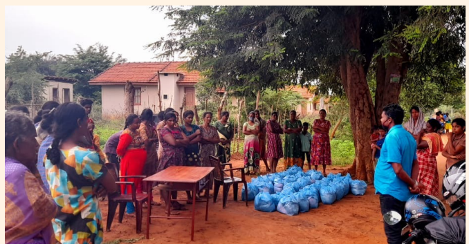
Supply to the flood victims in a remote village