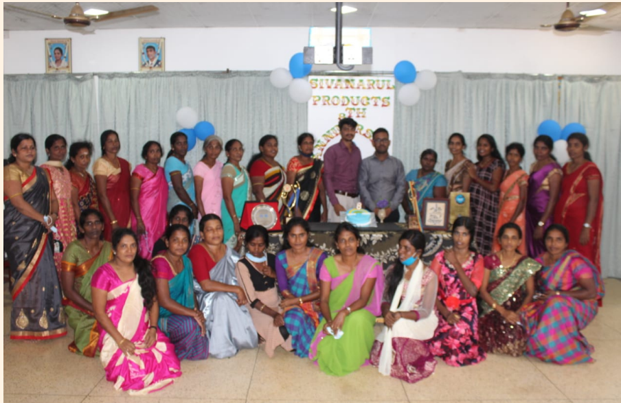
Staff at the 8th year celebration of the factory and bakery