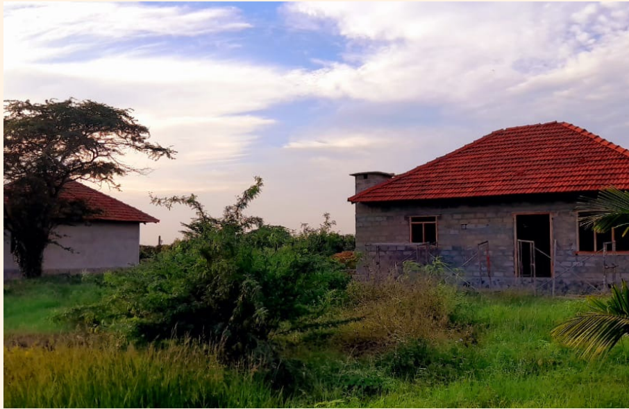
House for the boys built in Sivapuram