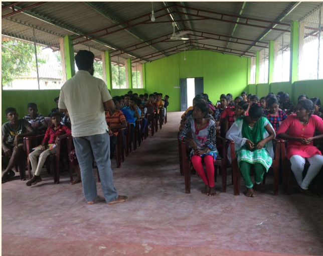
Recently built Education centre in Olumadu

Education is a key factor in promoting meaningful change and escaping the cycle of poverty in the North and East. It is our duty to ensure that we focus and invest in early learning centres in these vulnerable areas, to establish solid foundations and to maximize our children's academic potential thereby increasing their chances of accessing tertiary education and successful careers.