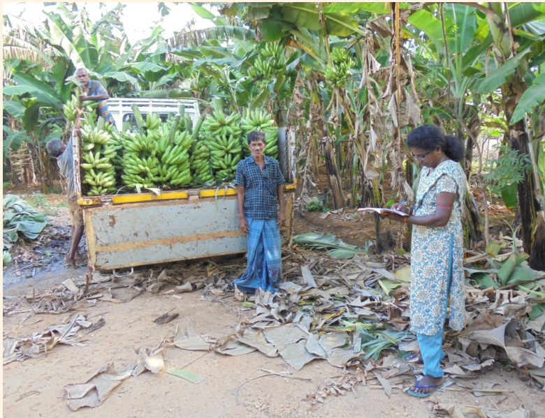
Bananas ready to be sold in the market