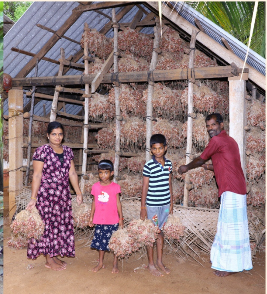
Successful onion harvest