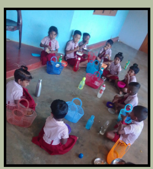
Pre school kids at the kindergarten at Palampitty