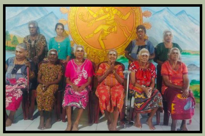
Elderly home in Yettiyanthota

In the same building, a separate computer school has been opened to offer free computer science education to children and youth. The computer courses were introduced to create more job opportunities for young people. Additionally, the centre is used to provide extra tuition classes for children who need support with their weaker subjects at school.