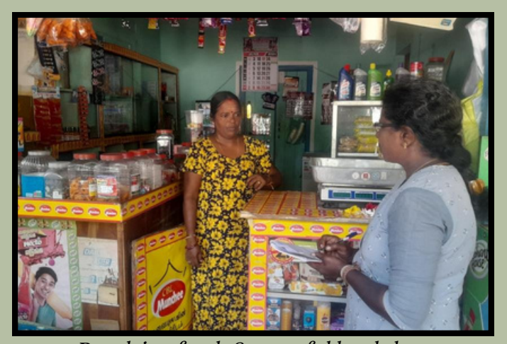
Revolving fund-Successful local shop

We deeply appreciate the generous support from the Australian Tamil Engineers Foundation for the revolving fund initiatives, as well as the individual donors and other organisations who have contributed to making these projects possible. Together, we are empowering individuals, strengthening communities, and fostering sustainable development.