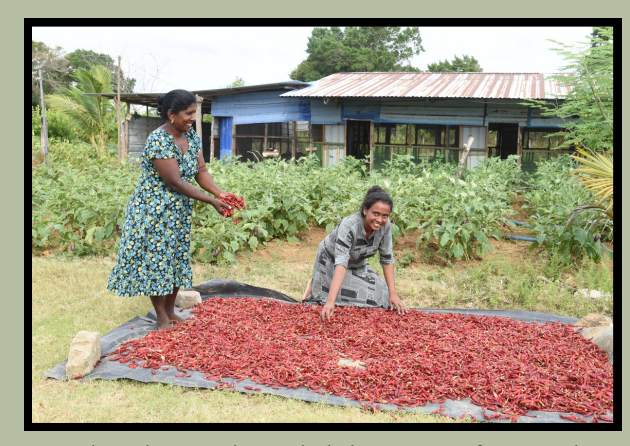
Ladies drying the red chilies at our farm to be sent to our factory

In addition to our efforts in agriculture, we are also working closely with Rotary clubs in both Australia and Sri Lanka to further develop the Thachanamaruthamadu farm. Our goal is to create sustainable job opportunities for villagers, teach them modern farming techniques, and build a long-term solution that will help strengthen the local economy. Through this collaboration, we are fostering skills development and ensuring the farm's growth is beneficial for everyone involved.