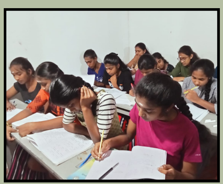
12 Girls from Upcountry receiving intense coaching for A/L exams