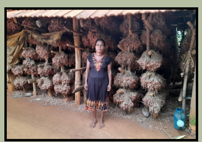
An amazing onion harvest