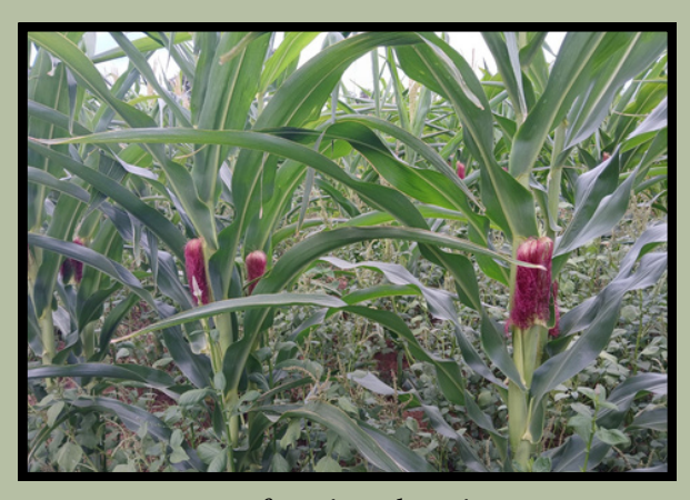
Corn farm in Palampitty